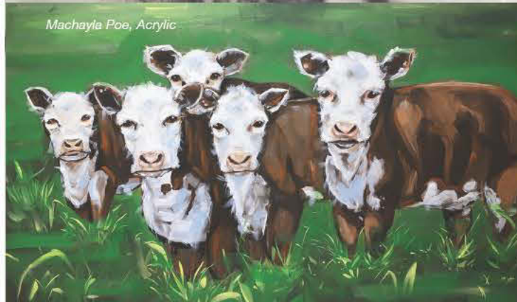
Machayla Poe, Acrylic