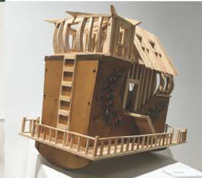
Bethany Shatz, Wood Sculpture