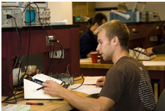
Physics 320 (Electronics).