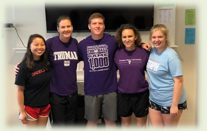
Preceptors and Directors