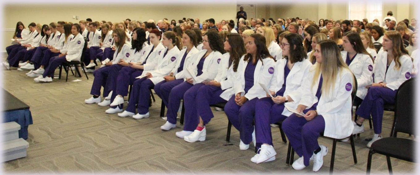
After pledging and cloaking, BSN class of '20 are welcomed into their clinical nursing education