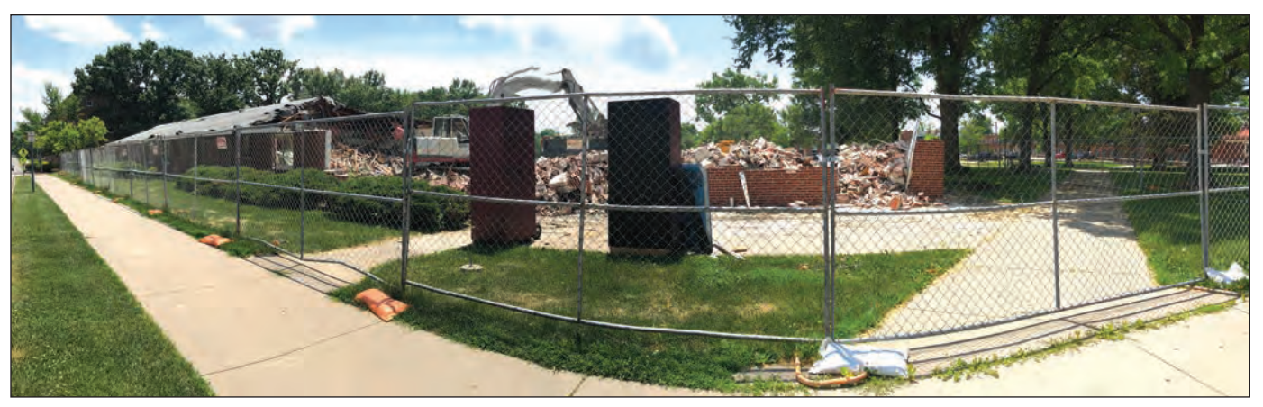
Violette Hall's south neighbor, Fair Apartments, is only a memory. Fair was beyond repair and was demolished during June.