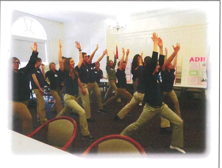
Students provided a yoga class as part of the Health Awareness fair.