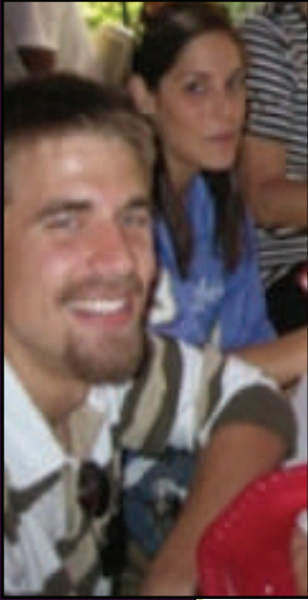
Political Science Students Association enjoying a picnic with faculty

This year marked the founding of the Political Science Student Association, a student-initiated effort that focuses on offering support of all kinds to Political Science students. The PSSA provides students with resources useful to upcoming careers, advice and planning for the major, and fosters a sense of community within the major.