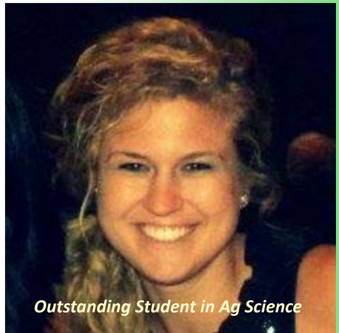
Outstanding Student in Ag Science

Plans after graduation: Going to Graduate school at Iowa State University.