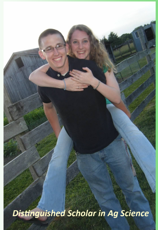
Distinguished Scholar in Ag Science

Plans after graduation: Attending the University of Arkansas Graduate School for a Master's Degree in Animal Science-Meat Science.