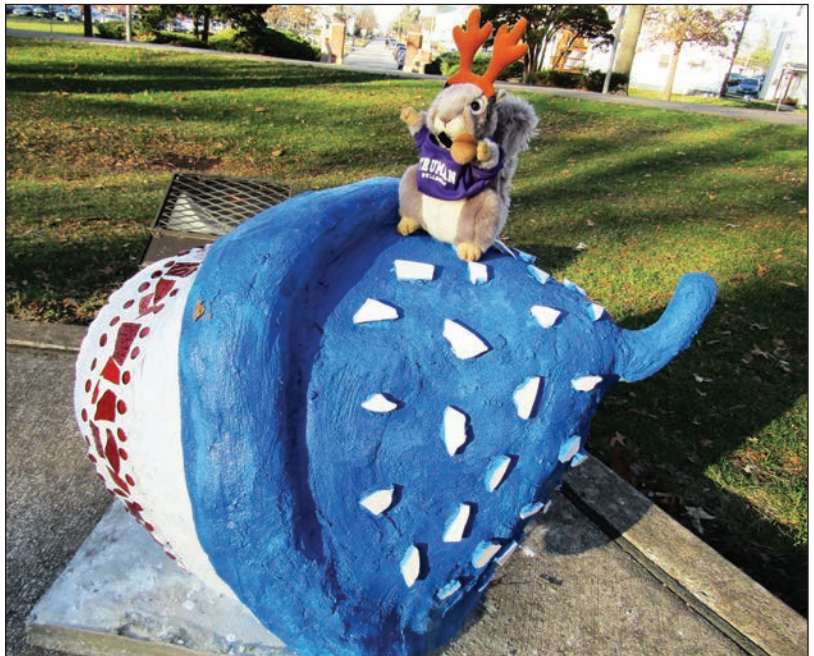
Stella the Squirrel (a holiday mascot for the School) was surprised by the acorns that mysteriously appeared December 2015.