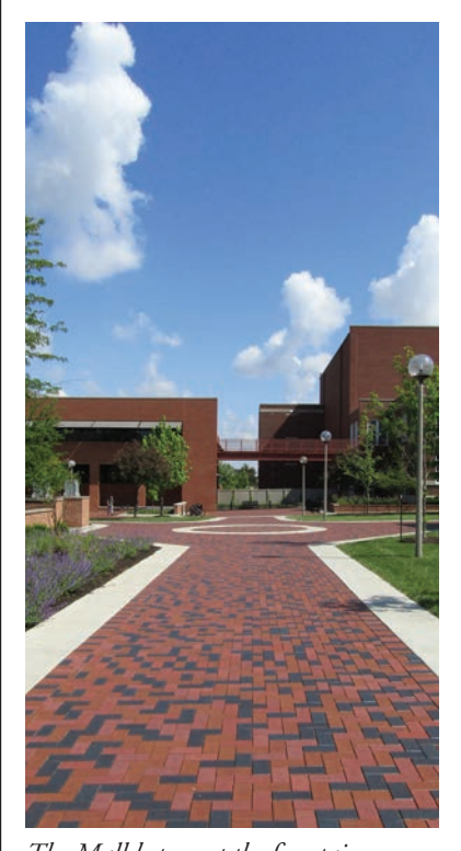
The Mall betweent the fountain and McClain Hall received a major renovation during 2016.