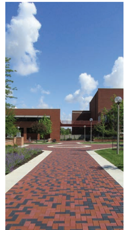
The Mall between the fountain and McClain Hall received a major renovation during 2016.

Graduating Students: 14.2% have studied abroad 96% have leadership experience 90% have major-related internship or work experience