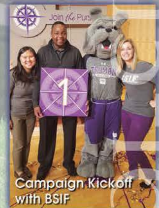
Campaign Kickoff with BSIF