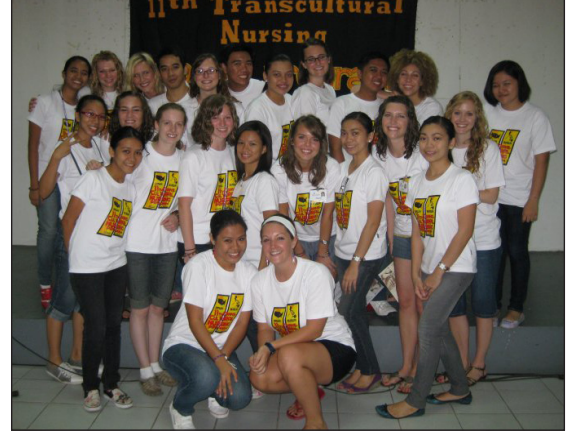
Truman nursing students pose with their nursing buddies from will present a West Visayas State University in Iloilo City, Philippines. program entit

Experience in the Philippines" at 7 p.m. Sept. 28 in the Student Union Building Activities Room. The event is open to the public and refreshments will be served.