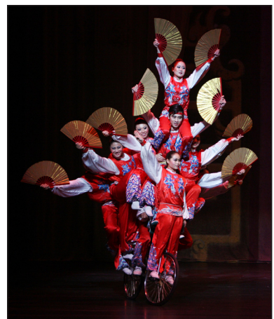
Golden Dragon Acrobats

Lyceum events, contact the Public Relations Office at 785.4016.