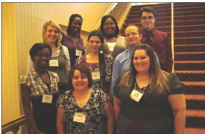
Truman McNair Scholars at the Missouri-Kansas-Nebraska McNair Heartland Research Conference in Kansas City, Mo.

year student in the political science doctoral program at the University of Michigan-Ann Arbor.