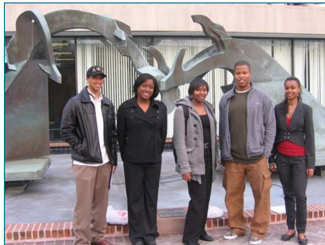
Howard University Visit