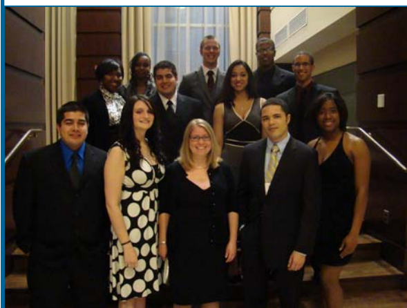
Maryland McNair Conference Dinner

The trip included a visit to the National Mall in Washington, DC, the White House, the World War II and Vietnam War Memorials, the Lincoln Memorial, and the Washington Monument. Scholars also toured the Smithsonian Museums of American History and Natural History, and were present when First Lady Michelle Obama's Inaugural Gown was unveiled as part of the "A First Lady's Debut" exhibit on March 10, 2010.