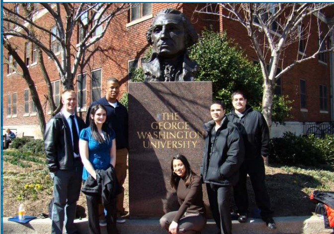
George Washington University Visit