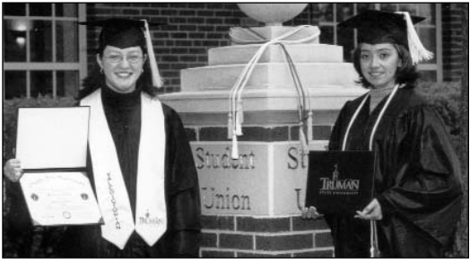
Students model and display the new graduation honor regalia and diplomas.

An undergraduate with the highest GPA in each graduating class is given the honor of valedictorian and will now wear a white satin stole with the Truman State University logo embroidered on the left and "Valedictorian" embroidered on the right.