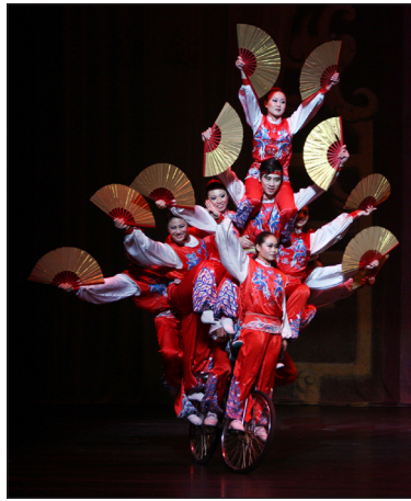
Golden Dragon Acrobats

For additional information about this or other Kohlenberg Lyceum events, contact the Public Relations Office at 785.4016.