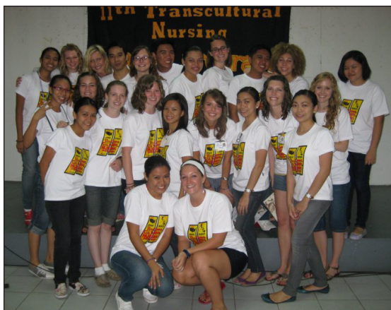
Truman nursing students pose with their nursing buddies from West Visayas State University in Iloilo City, Philippines.

The students prepared for this trip through classes about cultural immersion and communicable diseases last spring.