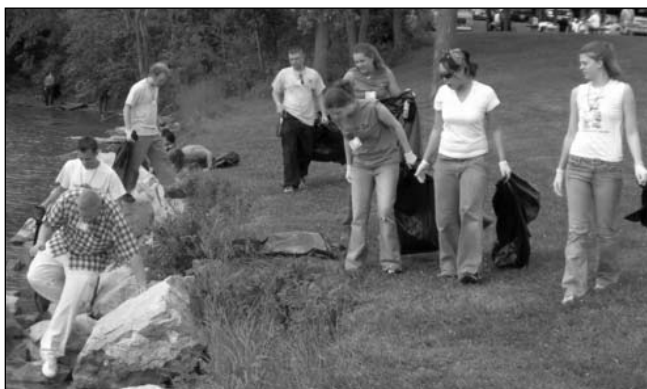
Members of the Residence Life staff pick-up trash as a community service project at Thousand Hills State Park recently.

As part of the week-long fall 2004 student adviser training, the Residence Life staff had approximately 100 student and professional staff members participate in a lake shore and trails clean-up at Thousand Hills State Park.