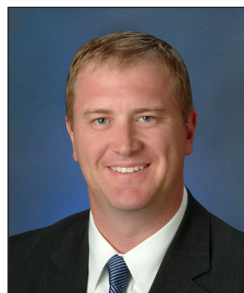
Senator Eric S. Schmitt

His public service includes serving as a Glendale, Mo., alderman from 2005-2008. He has also served on boards for DeSmet