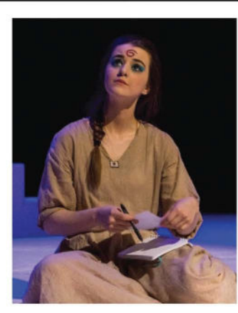
Love & Information

Our casts include students from all disciplines, from freshmen to seniors