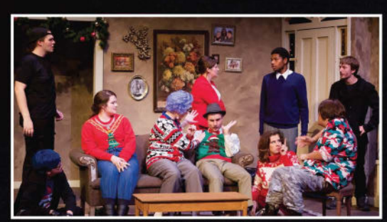
In-Laws, Outlaws, and Other People (That Should Be Shot)

Our program emphasizes practical experience at every level of production. We offer students transformative experiences; students perform, design, direct, choreograph, construct, circuit, paint, sew, write plays, research and teach.