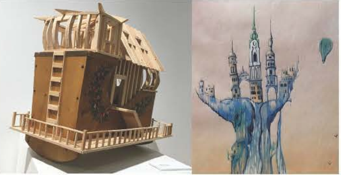
Bethany Shatz, Wood Sculpture