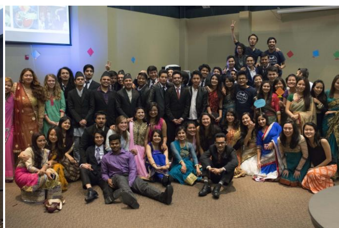
Dashain Night 2015