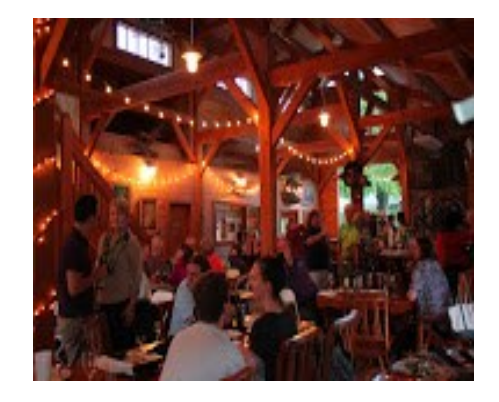
CML faculty celebrate the end of the semester with party at Jackson Stables!