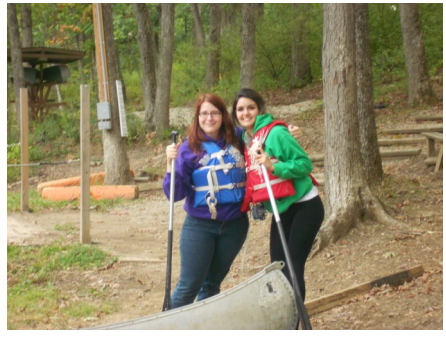
transport students Two French students prepare to out of Missouri. explore the lake by canoe at Camp Jo-Ota.

their listening comprehension and confidence in speaking has increased. French feature films, board games, French music help to transport students out of Missouri.