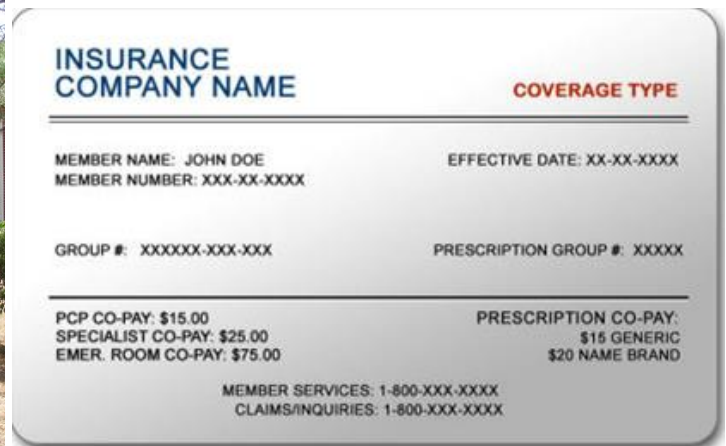
Sample Insurance Card