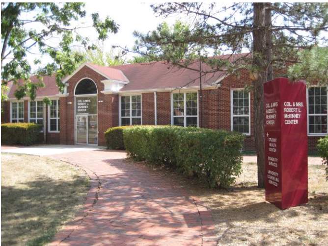
Health Center on Campus

The fee for health insurance coverage is approximately $750 each semester. This fee is charged on your student account and must be paid with your tuition and other fees.