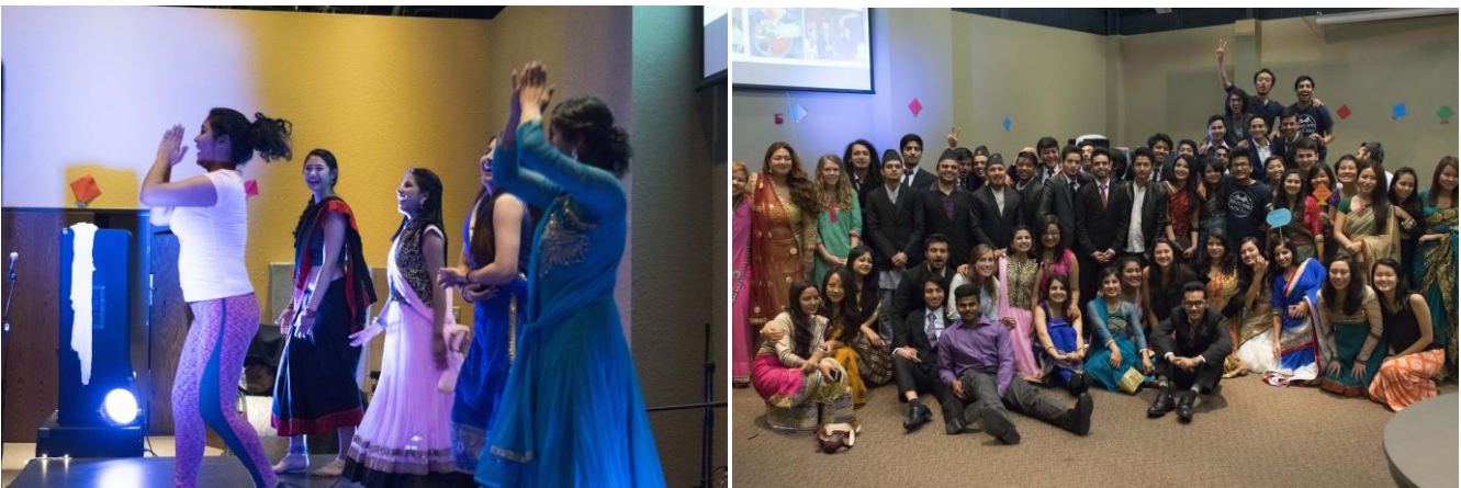
Dashain Night 2015

As you enter the U.S., your I-20/DS-2019 is stamped with the date of entry, place of entry, immigration status, and date of expiration of your stay. An I-94, which is issued electronically, must be printed after your arrival and carried with you when you travel. You will print your I-94 during orientation. These are very important documents. Do not lose them. Always carry your passport, visa, I-20/DS-2019, and I-94 with you while traveling in the U.S.