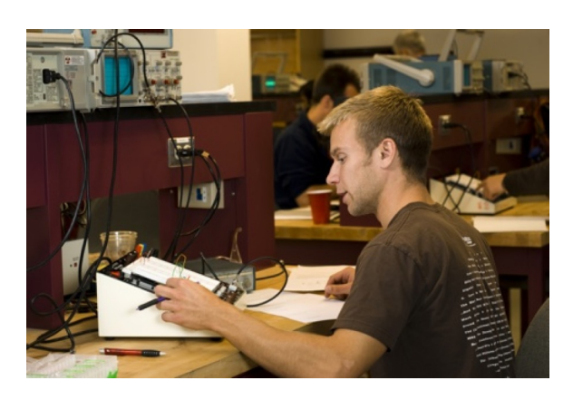
Physics 388 (Advanced Lab).