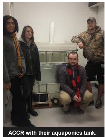
ACCR with their aquaponics tank.

Creation of the system has been quite an adventure for the group. Ideally, the way the aquaponics system will work is the group will have a large fish tank stocked with hybrid bluegill and then the waste water will go through a filtration system which will then be used to fertilize several hearty house plants growing on a platform above the tank. Click to learn more about the project.