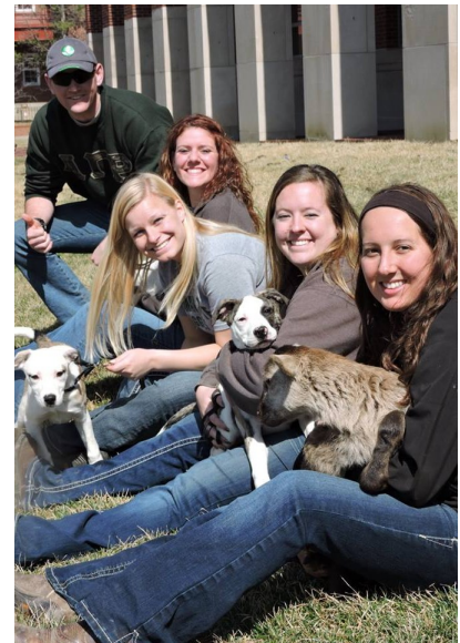
Petting Zoo Fun!

The discussion panel of alumni and local farmers at Tuesday's showing of Farmland. We were excited to see over 50 people come out for this event!