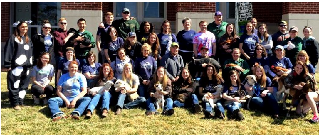
National Ag Week group photo on the mall.

Due to rain, the petting zoo that was originally intended for Thursday was moved to Friday. As usual, the zoo was a great success with so many students coming to see the lambs, goats, pigs, horses, chickens, bunnies, a cow, and puppies. Later, that night everyone headed to the farm for fried catfish and pulled pork and the hardest ag trivia anyone ever tried.