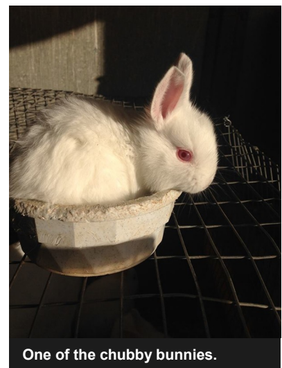
One of the chubby bunnies.

Chubby Bunnies started with three mother rabbits, all New Zealand Whites.... Click to read on.