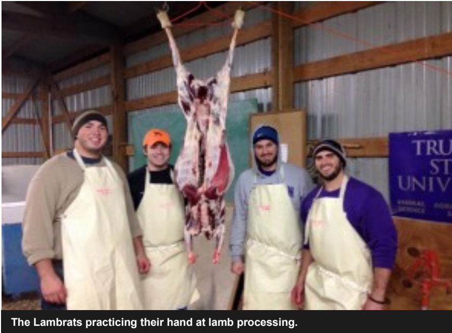
The Lambrats practicing their hand at lamb processing.