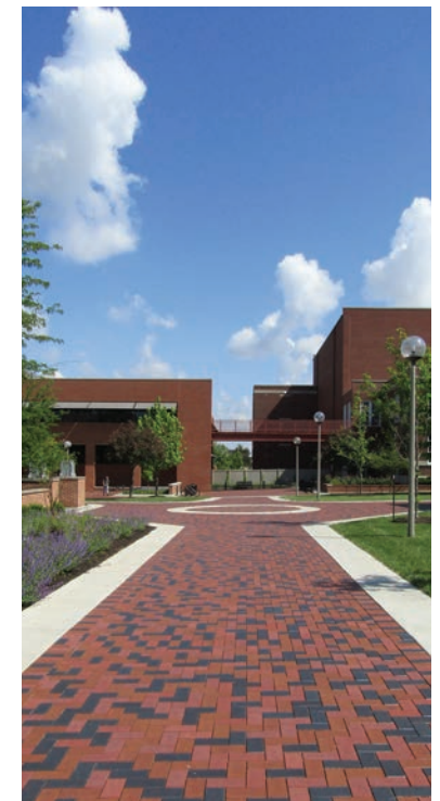
The Mall between the fountain and McClain Hall received a major renovation during 2016.