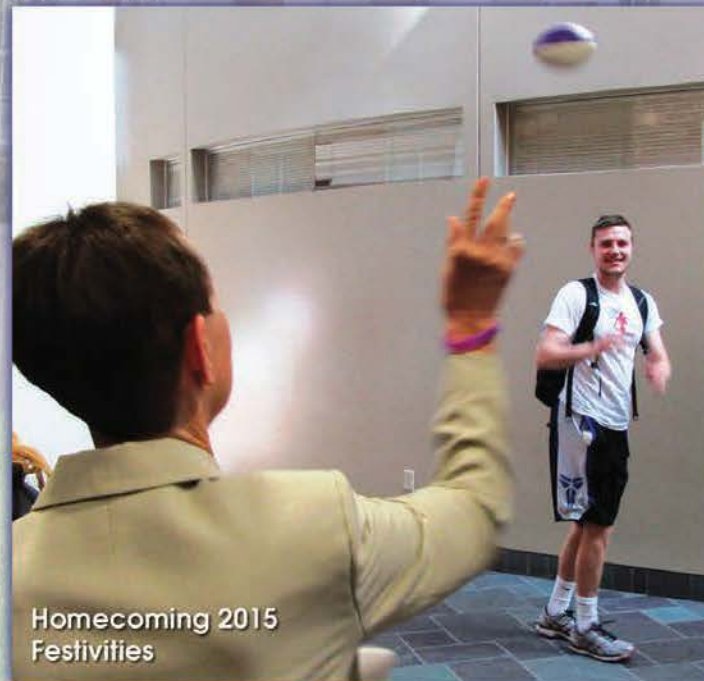
Homecoming 2015 Festivities