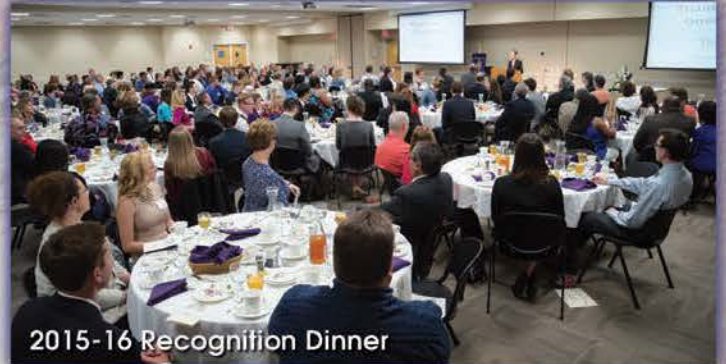
2015-16 Recognition Dinner