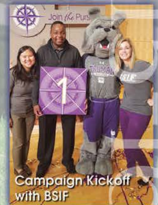
Campaign Kickoff with BSIF