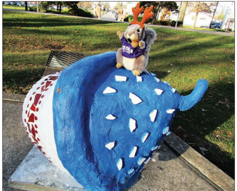
Stella the Squirrel (a holiday mascot for the School) was surprised by the acorns that mysteriously appeared December 2015.