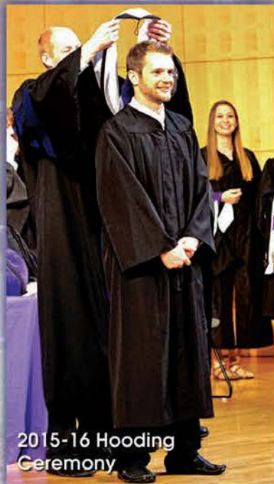
2015-16 Hooding Ceremony